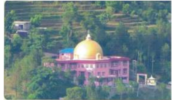
Yog Manav Vikas Trust, Banikhet, Himachal Pradesh

A systematic approach alone helps in developing a dependable engineering geological map defining subsurface geological model with lithological details and collection of structural data in understanding the engineering properties of the rock mass. The proposed five-day field training program by Dr Dhawan Academy of Geologists encompasses complete engineering geological mapping of a selected area in the vicinity of Chamera-1 Hydroelectric Project of NHPC. The participants would be introduced to all possible components and plotting of EGM (Engineering Geological Map) through field and desk work. The program is built to share the nuances of the associated field and desk top activities in delivering a world class dependable engineering geological map. The program content lays emphasis on general overview of principles and genetic concepts of geological mapping and allows the participants in successfully observing, measuring & recording geotechnically significant information in field, followed by plotting, processing and analysis of data in the preparation of the Engineering Geological Map.