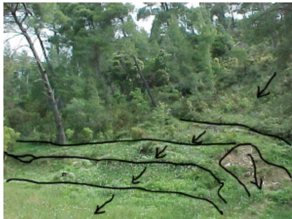
Figure 3. At the slope, over the road, landslide phenomena are occurred