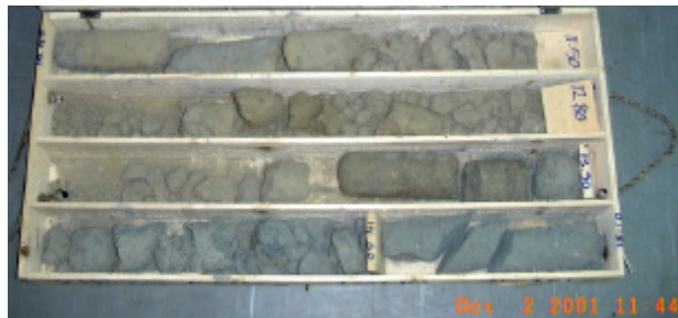
Figure 5. BoreHole samples from Olympia (sound marl: deeper than 13.80 m)

It is well known that erosion caused by running water or ground water and gravity is the more significant factor for the creation of landslides on unprotected slopes. The ground water decreases the shear strength of the material in an important depth, causing earth mass movements. The uncontrolled seepage of ground water, infiltrated through the joints of an impermeable silty or clay formation, also strengthens the ability of the slope for sliding (Vuillermet et al., 1994). In cases where these formations are overlain by hard rock layers, the erosion of silts and clays causes caving at the toe of these overlaying hard rocks creating toppling or sliding phenomena. Drainage is therefore critical to the stabilization of a slope. Removal of trees, with big roots, which involve to the destruction of the ancient retaining wall, strengthens the above process.