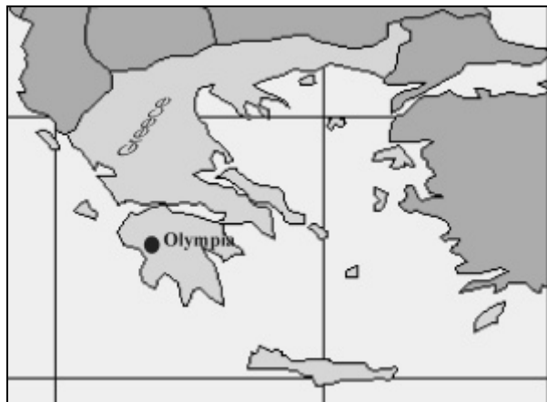
Figure 1. Olympia archaeological site

The archaeological site of Olympia is located in South Greece, in the Western part of Peloponnese (Figure 1). It was one of the most important sanctuaries of the ancient period, built in a valley, between Kronos Hill and the confluence of the rivers Alpheios and Kladeos. At this Sanctuary, pan-Hellenic games called Olympic, were performed from a very early period. With the Olympic Games, the ideal of noble rivalry found its complete expression and for many centuries forged the unity and peace of the Greek world. It has not yet been established when people first began worshipping at Olympia. However, archaeological finds show that the area was at least settled from the 3rd millennium B.C. it is also known that the first Sanctuary was the Gainon, which was found at the foot of Kronos hill and was dedicated to Geia (Earth), the wife of Ouranos (Heaven). That was also it is said, the most ancient oracle of Olympia (Pausanias V, 14, 10).