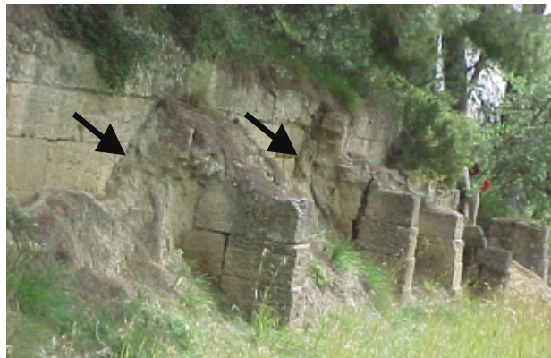
Figure 4. Destroyed ancient retaining wall

Test results were used for performing stability analysis of the slope. According to this elaboration, a safety factor of S.F.=0.17 was determined, providing the instability of the slope, especially at its lower part (under the road) where the archaeological site is located (Figure 6).