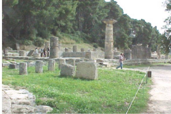
Figure 2. Part of the archaeological site

According to the grain size analysis of representative specimens, the material is composed of 22-17% clay, 43-80% silt and 35-3% sand. The liquid limit (LL) of the above specimens is 30-32%, the plastic limit (PL) is 22 and the plasticity index (PI) is 8-10%. The material presents low permeability and drainage ability. In dry conditions the material is compact, having uniaxial strength of 5-15 MPa. According to the performed triaxial tests, the cohesion is 17-23.7 Kpa and the angle of internal friction is 5,2-11^{\circ} . In rain conditions the material saturates rapidly, providing unstable conditions and important earth pressures on the ancient rocky retaining wall which lean downslope, under the pressure (Figure 5). The material of the slope is similar to that of Eptachori slope area, geologically located in the molassic formation of the Messoellenic Basin of N. Greece. (Christaras, 1997)