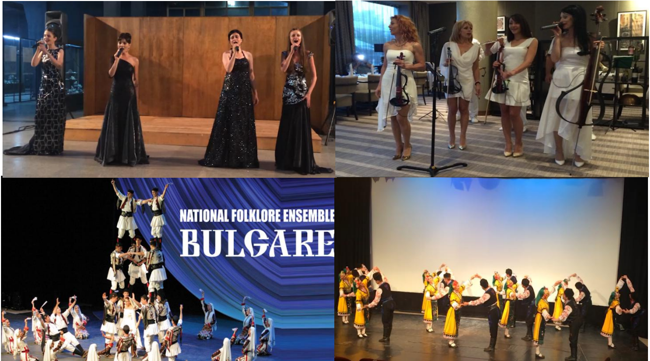
Photo of Music and Dance During the Symposium

During the event, a lot of music and dance were shown to all the delegates. The first day 4 opera singers sang at the end of the talks before lunch. The second evening, all of the delegates watched the National Folklore Ensemble -Bulgare in the theater, all of them enjoyed the group dancers showing off the national costumes and the national dances.