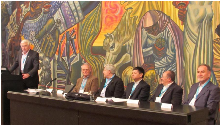
Photo of Opening Address before the Symposium

These topics were covered with more than 30 presentations from different delegates. During the symposium we have the pleasure to have delegates from USA, Italy, Russia, Turkey, Greece, Serbia, China, UK, Iran, and many others. All of them have given excellent presentations and reports in the session.