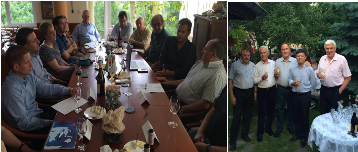
Photo of European IAEG NG Presidents Meeting