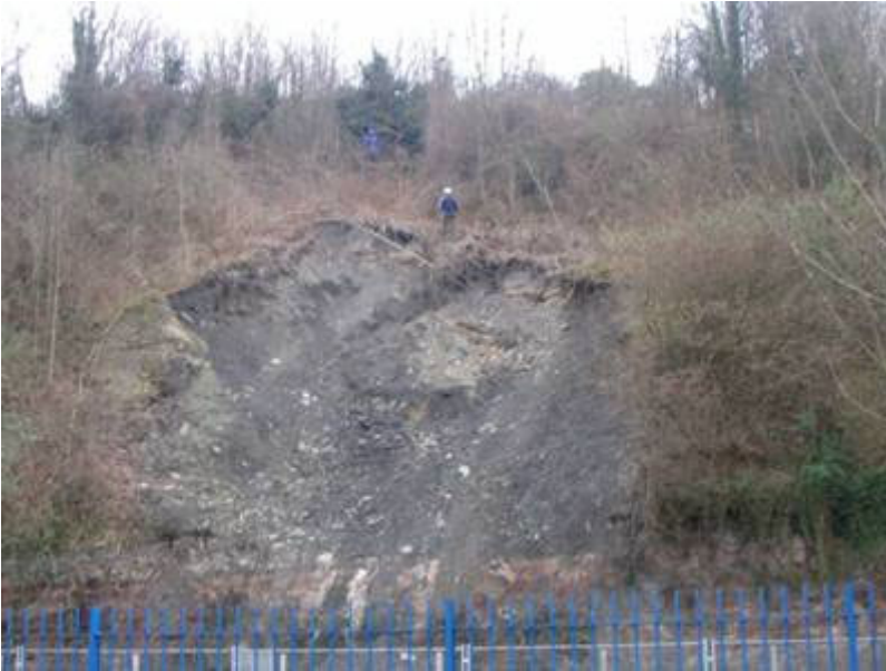
Figure 1. 2004 Slope Failure at Penarth Escarpment

The sequences of strata within the length of the escarpment are also controlled by geological structure. The NW to SE trending Penarth Fault traverses to the south behind the escarpment crest. Several smaller subsidiary faults are also known to be preset above the escarpment crest from geological mapping (Lawrence & Waters (1972), British Geological Survey (1989)). Thus, changes in elevation between the formations occur both along the escarpment and potentially laterally within it.